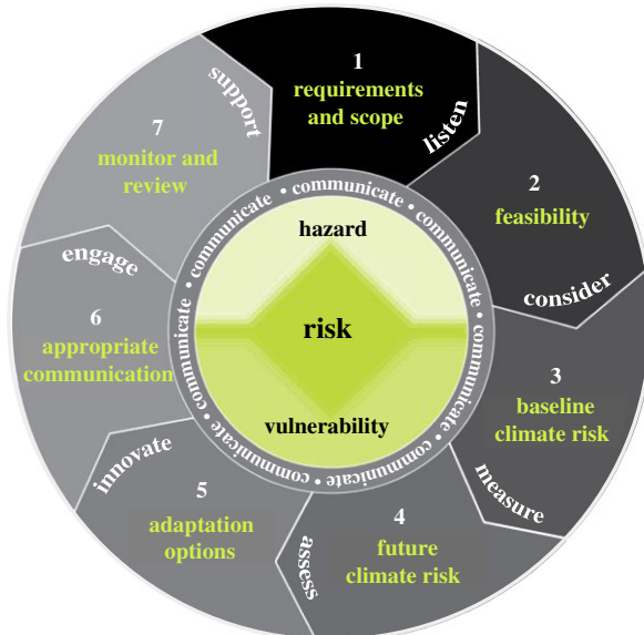
Figure 1. Schematic of the climate impacts and risk assessment framework (CIRF). (Online version in colour.)

that are, in fact, interrelated: ecological field measurements relevant to both vectors and hosts, laboratory experiments to investigate single-system and multi-system (i.e. one or more components of pathogen, vector and host) effects and rates, economic variables (e.g. land use, economic indices), sociological (e.g. education level, human movement, transportation), medical (e.g. reporting, vaccination, hospital availability) and political (e.g. border issues).